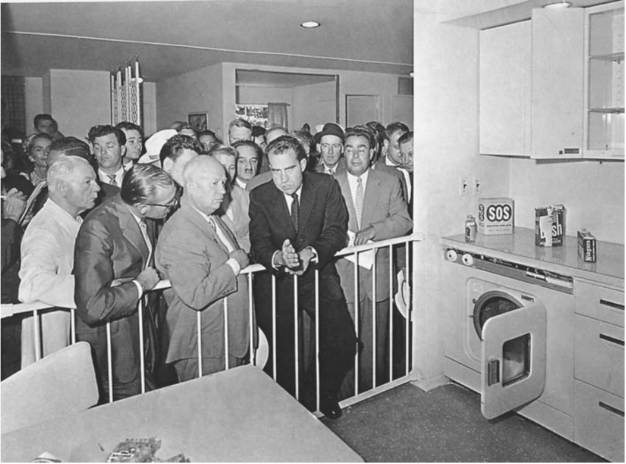
FIGURE 3 Vice President Richard Nixon and Soviet Premier Nikita Khrushchev spar verbally at the American Exhibition in Moscow in 1959. Here they engage in the “kitchen debate” as they fight the cold war over the commodity gap rather than the missile gap.

proclaimed that the “model” home, with a male breadwinner and a full-time female homemaker, adorned with a wide array of consumer goods, represented the essence of American freedom: